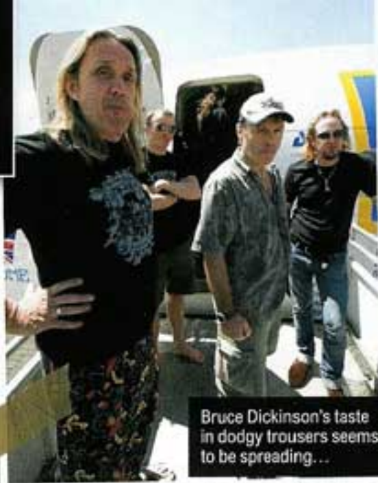
Bruce Dickinson's taste in dodgy trousers seems to be spreading...