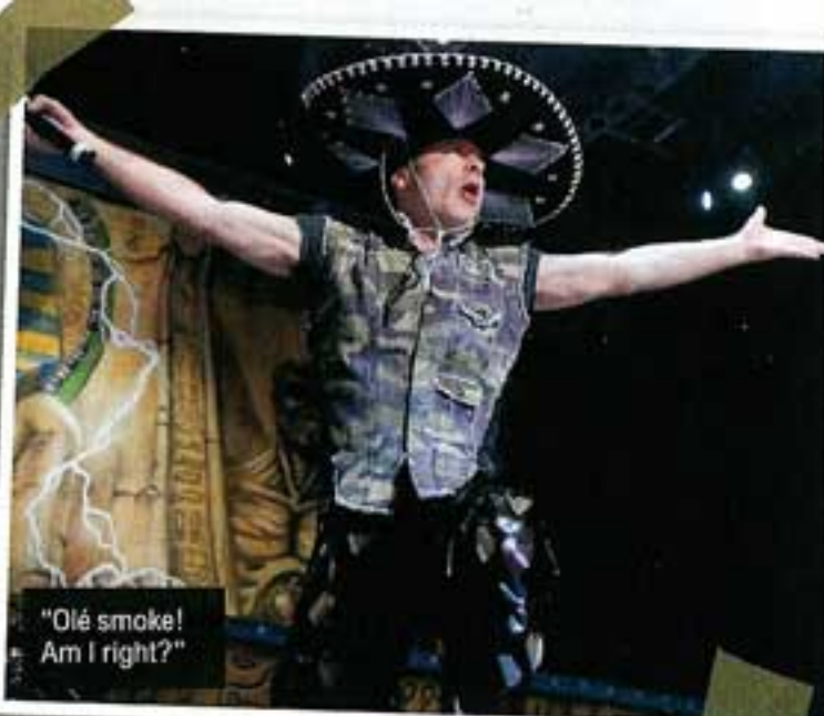
"Olé smoke! Am I right?"